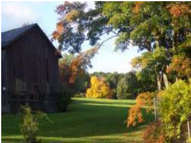
Watson Park in early fall