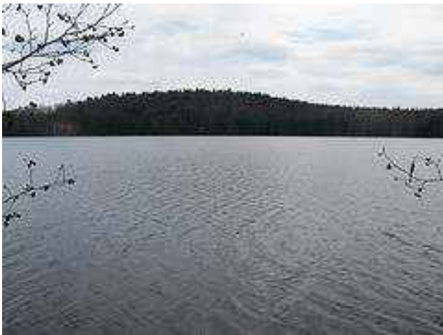
Russell Pond: just the place for a summer idyll.